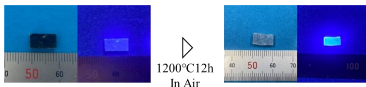
Figure 1. (Left) As-grown and (Right) Air-annealed YNbO 4 crystal.

The YNbO 4 specimen was successfully fabricated by cleaving the solidified YNbO 4 melt, as shown in Fig. 1. The as-grown crystal was dark black in color and exhibited weak blue emission under UV irradiation. By measuring the transmittance spectra, the dark color was revealed to be due to oxygen defects. Post-annealing was performed in air and O 2 atmospheres, and the optimal condition was found to be O 2 -annealing at 1200°C (12 h).